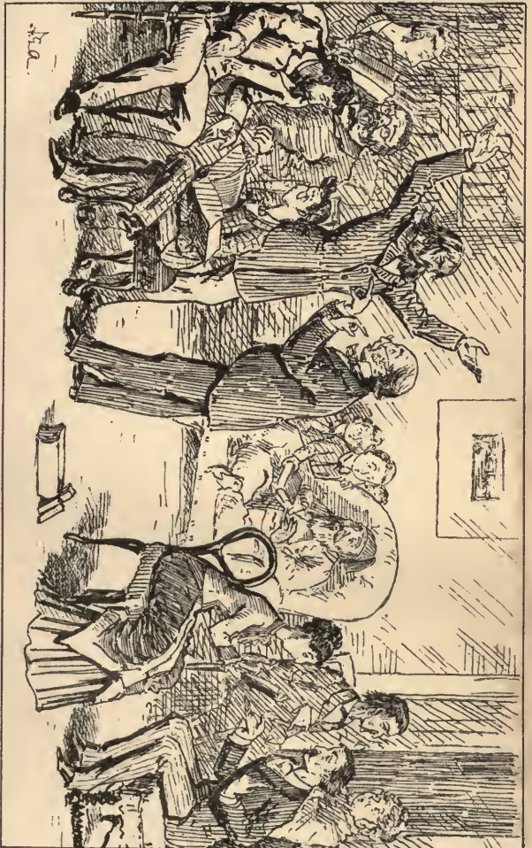
The Peterkins determine to study the Languages